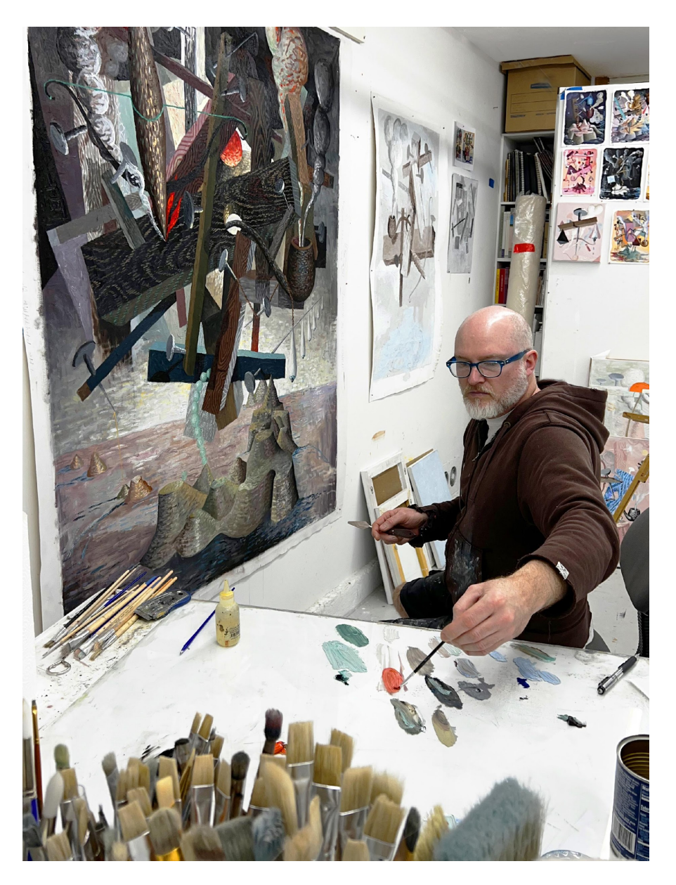
Matthew Couper studio, Mojave Desert, USA, 2023

05 - 28 MAY 2023 MAGMA GALLERIES, 5 BEDFORD ST, COLLINGWOOD, VIC OPENING RECEPTION: FRIDAY 05 MAY, 6-8pm