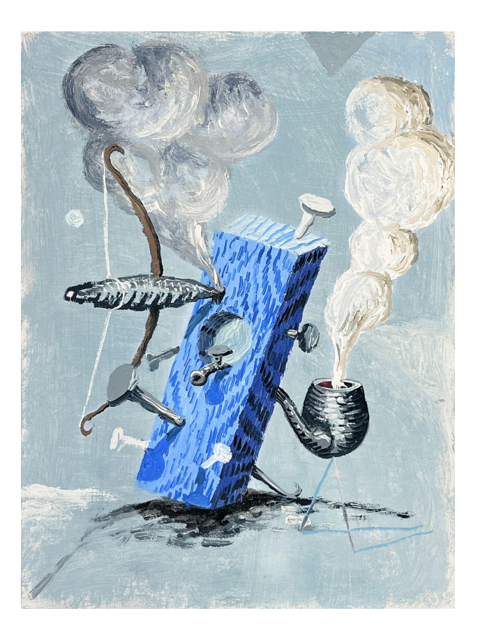
Study for a Sculpture #6, 2023, oil on cardboard, 28 x 20 cm