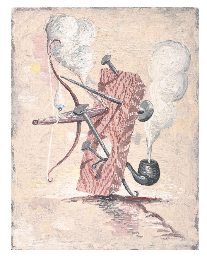
Study for a Sculpture #4, 2023, oil on canvas, 34 x 26.5 cm

After three years of developing the language of painterly aesthetic survival methods on canvas, Couper has been awarded an artist residency with Urban Art Projects (UAP) in Brisbane, AU. He will be translating his large format paintings into sculptures, focusing on the interplay between materials and form. The oscillating compositions of nailed-together lumber, ropes, dripping eyeballs and billowing pipe smoke will be portrayed in the tangible forms of wood, aluminium, glass, bronze, gold-leaf and the architectural protection technique of yakisugi . In a similar way to Couper's make-shift constructions in his paintings, the sculptures implement various techniques with a variety of materials to realize the work in 3D. A central wooden block anchors the sculpture as a figure with vestiges added or protruding from the center mass. Blown and shaped glass depicts a rising, bulbous cloud of pope smoke, while oversized bronze and aluminium nails pierce the form like a Saint Sebastian figure or an Nkisi figure from the Congo. The form ceases to be a make-shift shelter and morphs into an animated figure burdened by the appendages of its process.