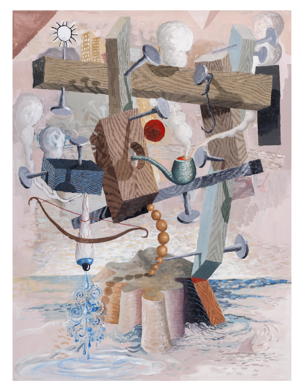
Matthew Couper, Crying Bowdrill, 2023, Oil on canvas, 140 x 100 cm

From the middle of 2019, desert island landscapes, moody skies enveloped with plumes of smoke, eyeballs with decorative tears, nails and Malevich-like constructions inhabit the canvases. Modes of survival are presented in tools such as the fire-starting bow drill and the ominous shark fin in the surrounding sea. Constructions provide shelter.